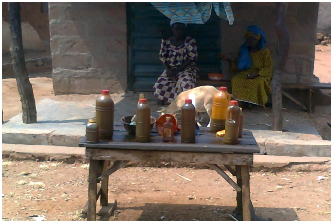
Figure 2 Petroleum products on display for sale by fuel vendors in a village